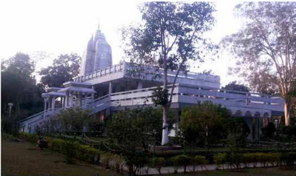
Radha Krishna Mandir